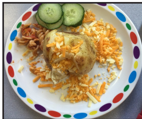
Jacket potatoes are a tasty, filling option.