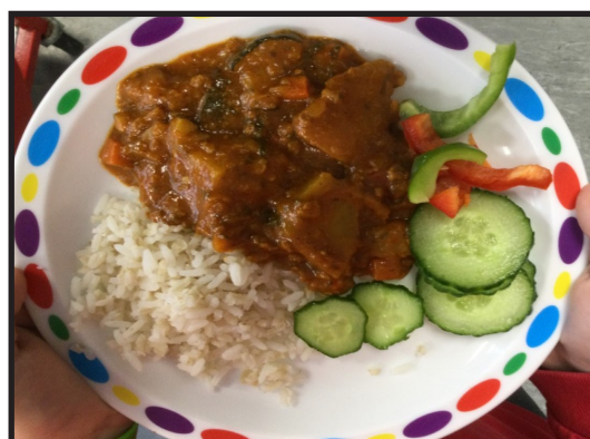
We offer great hot options.