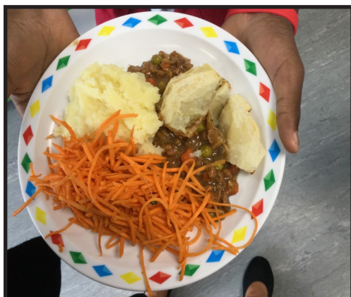
One of our delicious hot meals, this has a Halal option too.