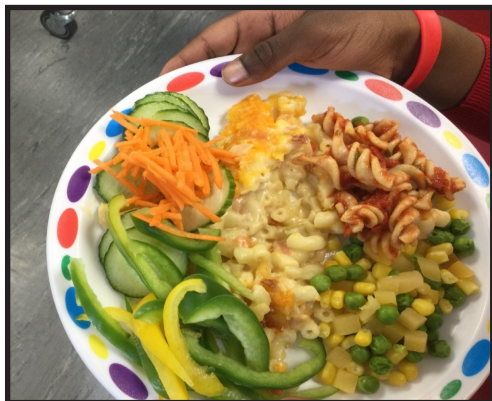
One of our pasta meals with vegetables and lots of salad from our daily salad bar.

Here are some pictures of some of the meals we provide.