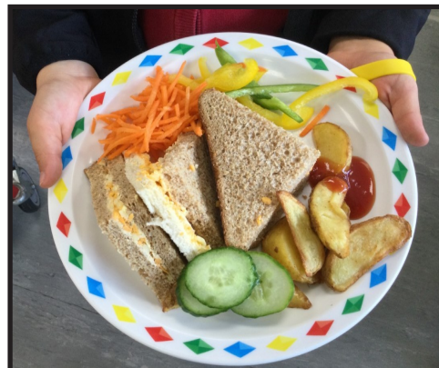
We offer a cold option if children want a change.