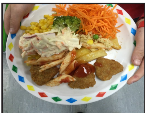
Fish bites are popular, so are the days we have fish fingers.