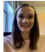
Speech and Language Therapist