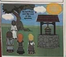
Jesus is alive

Later that day, the women saw Jesus and started worshipping him. Afterwards, they went to tell the apostles.