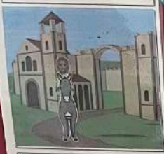
Jesus enters Jerusalem