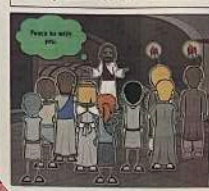
The Apostles see the Risen Jesus

The apostles were in a room when Jesus came to them and showed his wounded hands to show it is really him.