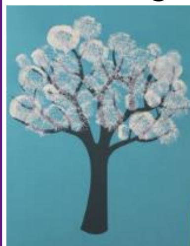
Cotton ball print

Next week we are going to start talking about Winter! Can you find a winter themed story or film to watch? What winter craft can you do for homework?