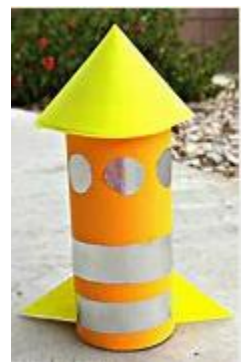
Bonfire Night Rocket