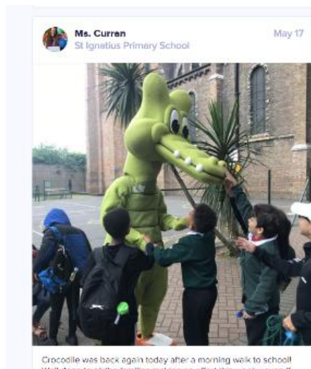
Crocodile was back again today after a morning walk to school! Well done to all the families making an effort this week - even if