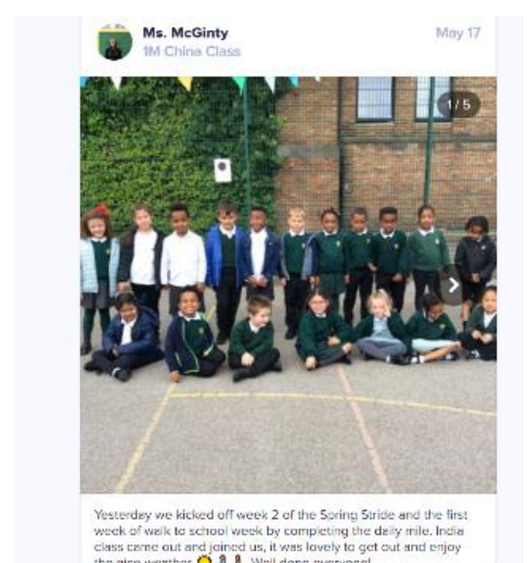
Yesterday we kicked off week 2 of the Spring Stride and the first week of walk to school week by completing the daily mile. India class came out and joined us, it was lovely to get out and enjoy the nice weather 🌞🌞 Well done everyone!