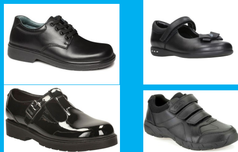
Examples of school shoes permitted to be worn