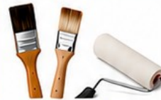
decorating paint brushes & rollers