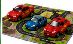
cars & car mats