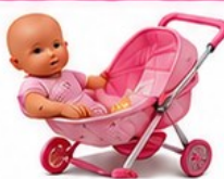
dolls & doll prams