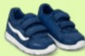
Change of Shoes