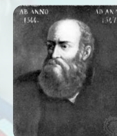
Realdo Columbo (1578-1657)