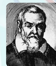
Sontorio Sontorio 1603