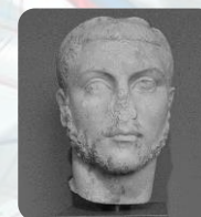
Claudius Galen Physician C130 - 210AD