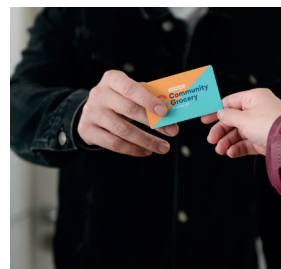
Your membership card