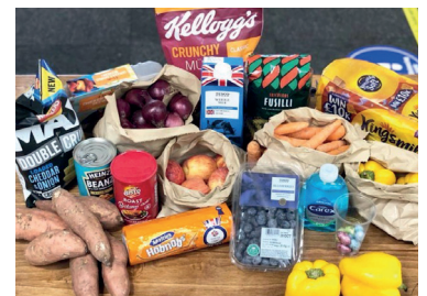
Example of a £4 shop

Our members not only get to save on their food shop but they also get to play their part in helping to protect the environment. Lots of the items in our grocery have been given to us by local supermarkets and would have normally ended up going into landfill. The food is all great, and there are many reasons why supermarkets have surplus food to donate. It may be there are packaging mistakes, errors with ordering or that the food that ends up too close to its 'best before' date for them to sell. So they've given it to the Community Grocery.