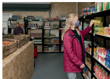
Inside a Community Grocery