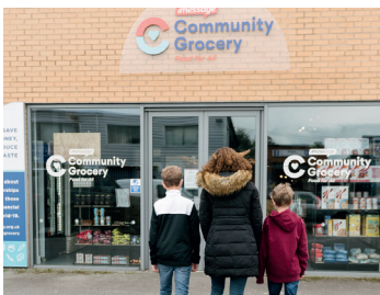
The first Community Grocery

We know choosing the items you like for your family is really important and so we have thousands of products to select from each week with new lines added each day.