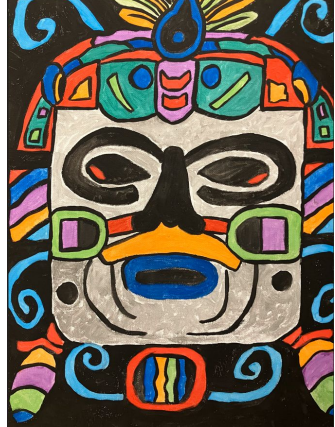
Jack Sparke, 7A