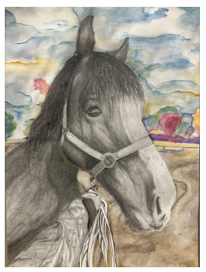
Emily Crawford 11H