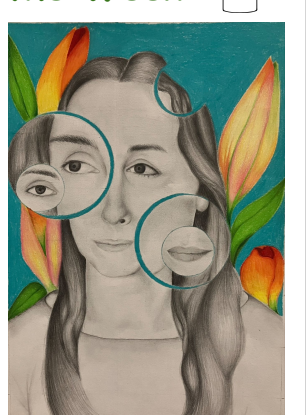
April Greenup 11A