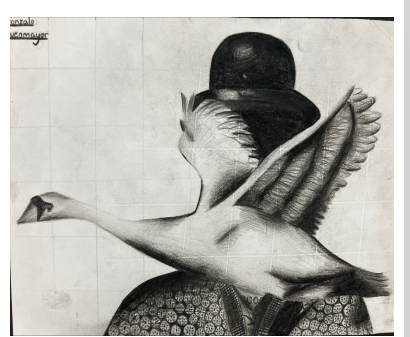
Evan Bowes 12C