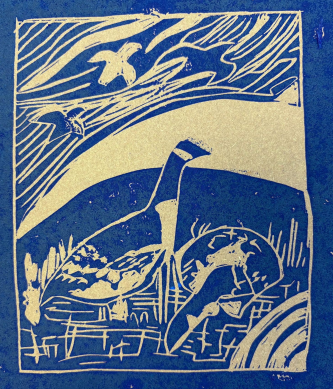
Hollie Hopps 11M