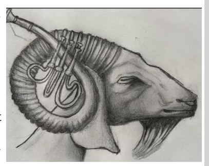
Kea-Shenell Wood, 8H