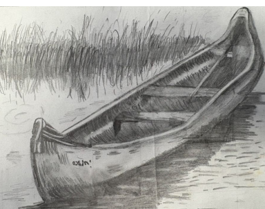
Caelan Hodgson 10N