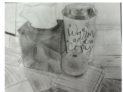
Emilia Kucharska 7Y