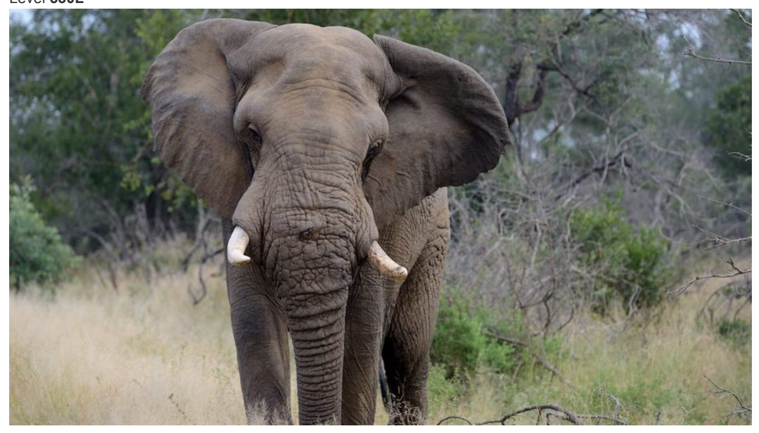
Image 1. An African elephant in South Africa's Kruger National Park. The African elephant is the world's largest land animal.

By Gale, Cengage Learning, adapted by Newsela staff on 01.16.18 Word Count 551 Level 530L