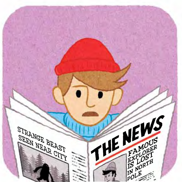
His dad had got lost while exploring the North Pole.