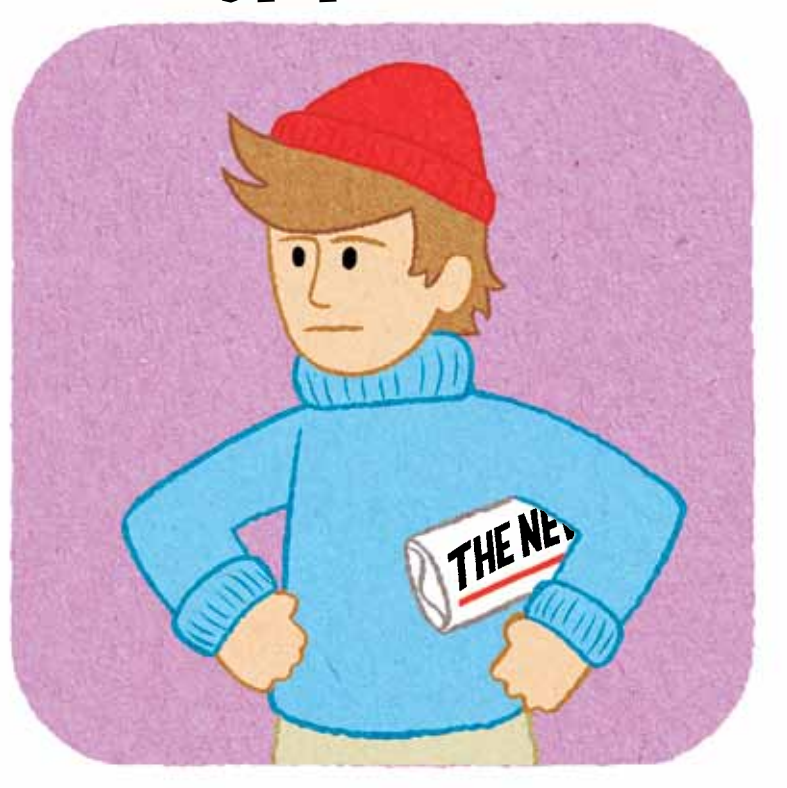
Tom resolved there and then to go and rescue him.