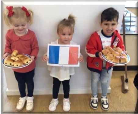
Class 3 had fun celebrating European Day of Languages today, and they completed our fun run! Well done class 3!

Through celebrating and prioritising Fundamental British Values, we believe that throughout our pupils' time at St Joseph's we aim to develop their ability to show initiative and understand how they can contribute to the wider community. We hope that our pupils will have the confidence to take risks and face the challenges of the future.