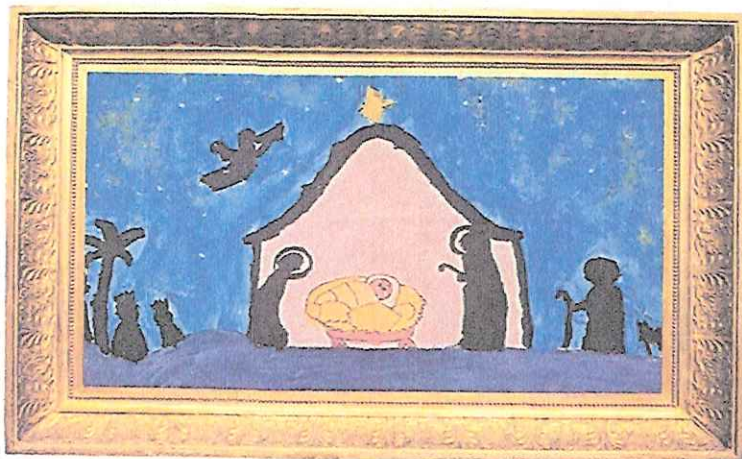
INFANT 3RD PLACE 2022/23