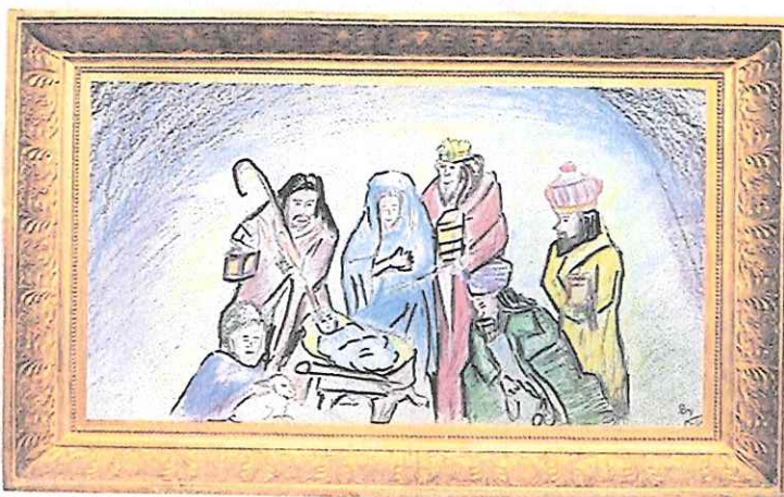
JUNIOR 3RD PLACE 2022/23