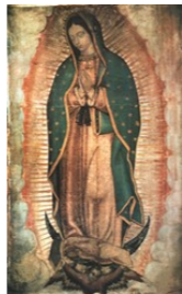
Our Lady of Guadalupe Pray for Us!

Please visit the Right to Life website to use the tool to contact your MP now. It only takes 30 seconds.