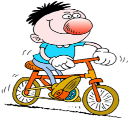
The Christian life is like riding a bike - always a bit wobbly, but always in the right direction