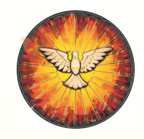
The Advocate, the Holy Spirit, will teach you everything