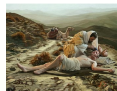
The parable of the Good Samaritan

A lawyer stood up to test Jesus. "Teacher," he said, "what must I do to inherit eternal life?" He said to him, "What is written in the law? What do you read there?" He answered, "You shall love the Lord your God with all your heart, and with all your soul, and with all your strength, and with all your mind; and your neighbour as yourself." And he said to him, "You have given the right answer; do this, and you will live."