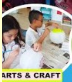
ARTS & CRAFT