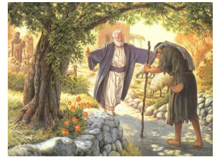
The vivid parable of the Prodigal Son, on the Father's patient love

There was a man who had two sons. The younger of them said to his father, 'Father, give me the share of the property that will belong to me.' So he divided his property between them. A few days later the younger son gathered all he had and travelled to a distant country, and there he squandered his property in dissolute living.