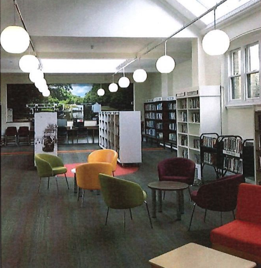
Study space and activities

If you are a teacher and would like to arrange for your class to visit the Library, please email hcl@hanwellcommunitylibrary.org.uk