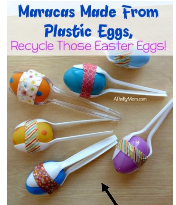
Put lentils or rice inside!