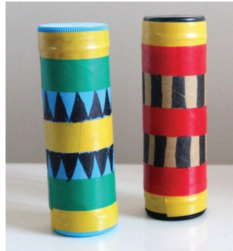
The easiest paper roll Shakers