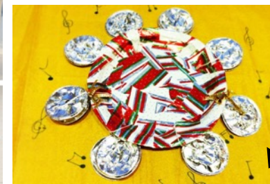
Tambourine with milk bottle tops