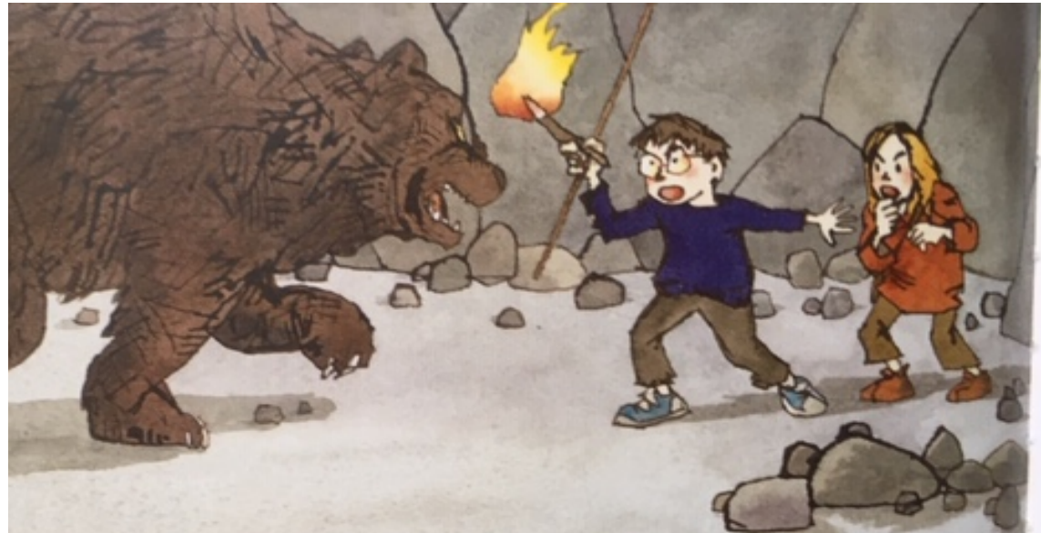
Stone Age Boy

To help us, we will borrow the structure of the Stone Age Boy story.