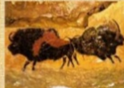
Art and Sculpture