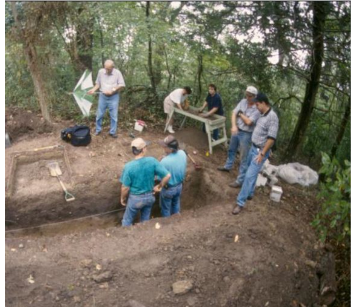
Archaeologists at work