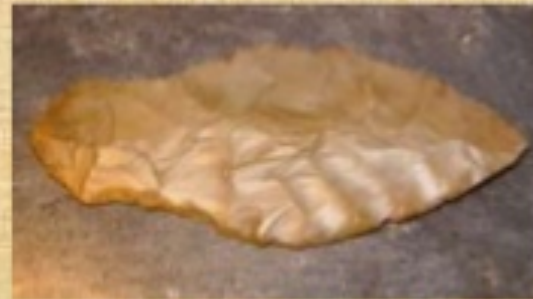
Tools and Weapons

Artifacts are anything that people modify or use. They can include: