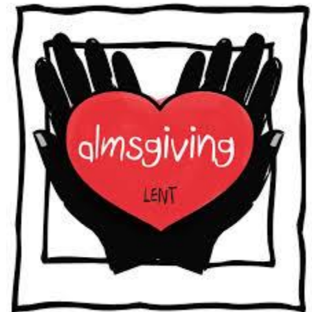
Help those in need