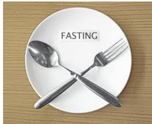
Give up something