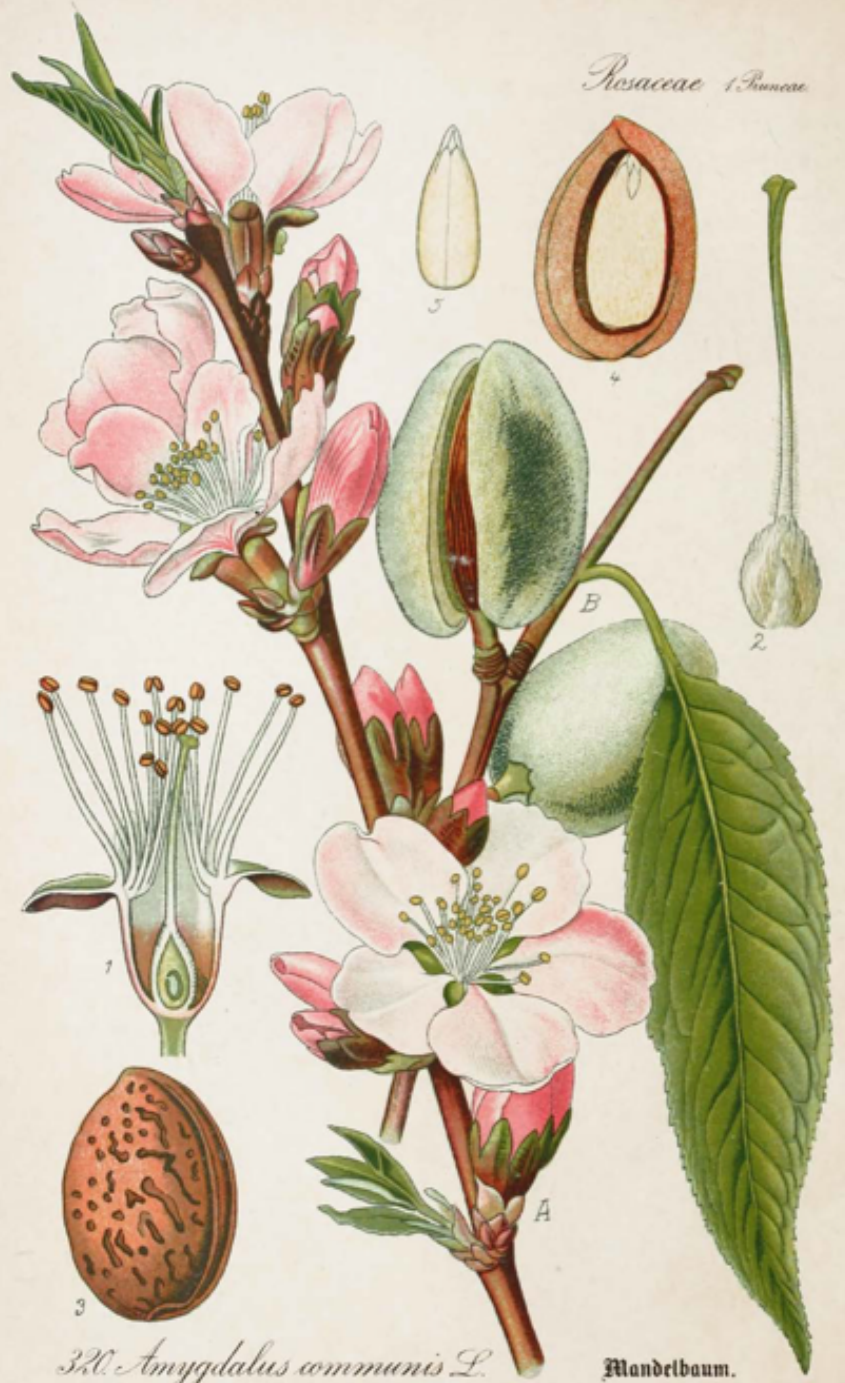
320 Amygdalus communis L.