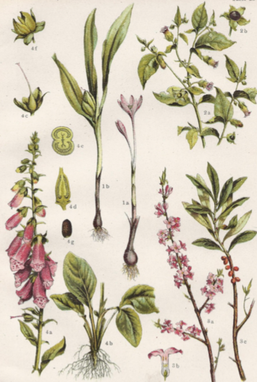
1 a, b. Herbstzeitlose. Colchicum autumnale L.