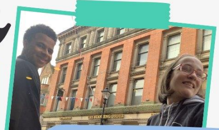
Our Macmillan Coffee Morning raised over £100

Our new Year 12s have settled in brilliantly and are already making fantastic progress. Our Year 13s have led the way as great role-models. As well as developing their Maths and English knowledge in real world settings, all of our students are gaining invaluable work experience through their projects and work placements.