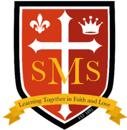
St Mary's Catholic Primary School Learning together in Faith and Love