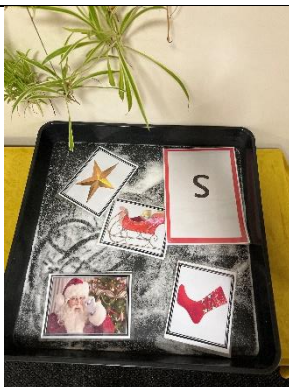
Phonics Phase 1

**Finding different ways to feel calmer or happier especially when experiencing a range of emotions e.g. asking for a cuddle, taking deep breaths, 5 finger breathing, reading a book, sitting in a quiet space, counting to 10 then talking about what happened etc.