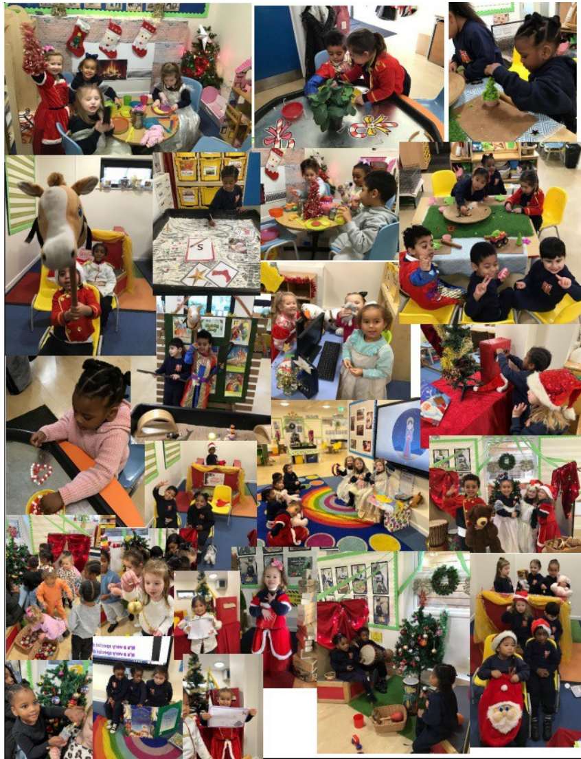
Children were really excited having Christmas Lunch wearing their amazing Christmas jumpers