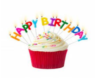
Zamarah ~ Y4