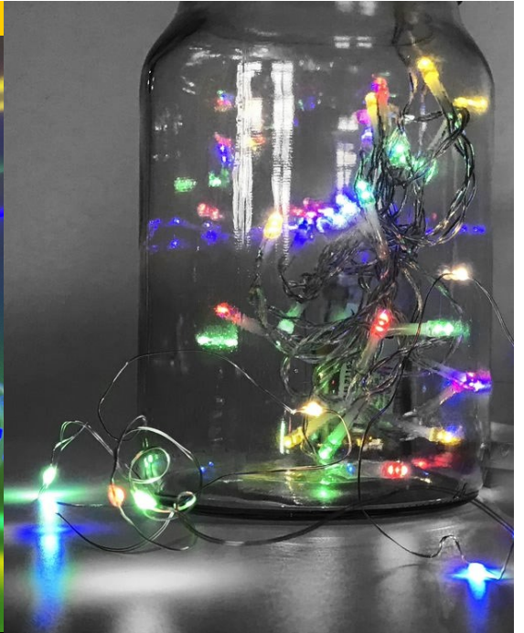
Y9 light shots in movement and light painting