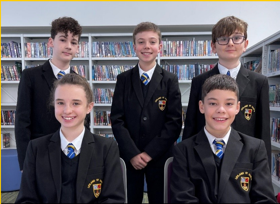
Our Year 7 Gold Winners

In November each year schools across the UK are invited to take part in the annual Bebras Challenge. Pupils are set a series of tasks in which they have to show their logic and problem solving skills. The aim is to enthuse students in all things Computer Science, whilst also helping students and their