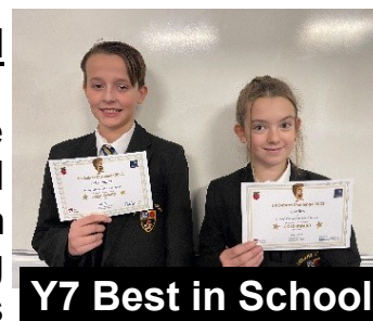
Y7 Best in School

It's that time of year again when students in the UK are invited to take part in the annual Bebras Computational Thinking challenge . Pupils are set a series of tasks in which they have to show their logic and problem-solving abilities. The aim is to enthuse students in all things Computer Science, whilst also helping students and their teachers identify hidden talents within the subject. Students are encouraged to simply do their best each year and try and solve as many problems as they can in the time allocated.