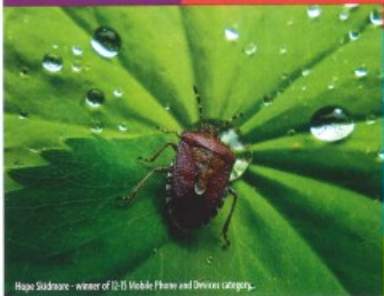
Hugo Skidmore - winner of 12-15 Mobile Phone and Devices category.