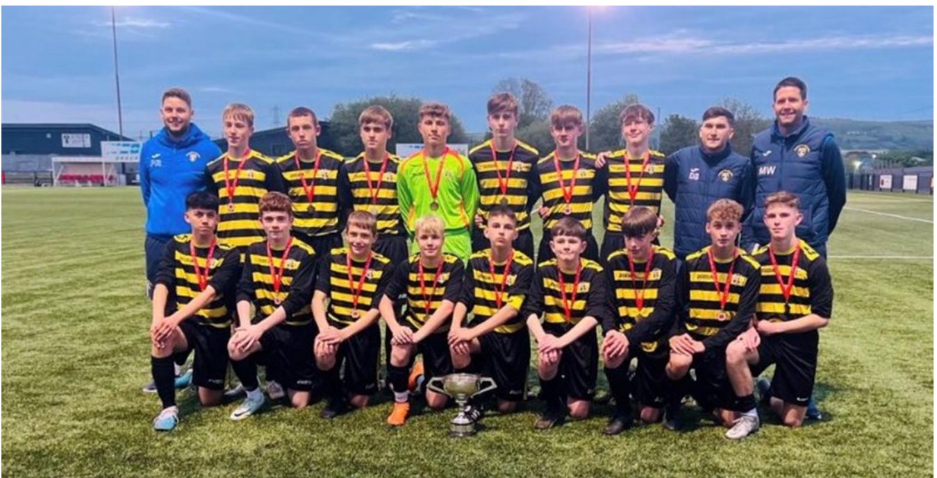
The Year 9 football team and PE staff, after beating Clitheroe Grammar School in the final of the Lancashire Cup