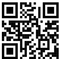
Arbor Login Page

We recommend downloading the Arbor app for your mobile phone as this will save you time.