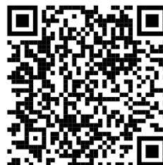
New Starters Page

If you have any questions, please contact arbor@ismchs.com