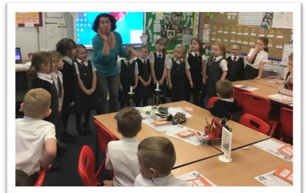
In Y1, she taught the children a prayer and the boys got to wear a Kippah.