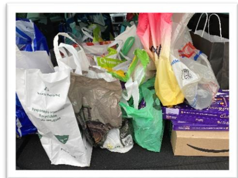
Car boot full of tins and chocolates

Thank you very much for your donations of tins of meat and selection boxes. They were gratefully received by the volunteers at the foodbank, one of whom is a parent of children who left St Mary's over recent years. Thank you very much, again for your generosity!