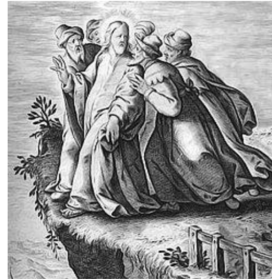
Jesus is rejected in his hometown by Marten de Vos

Jesus began to speak in the synagogue: 'This text is being fulfilled today even as you listen.' And he won the approval of all, and they were astonished by the gracious words that came from his lips. They said, 'This is Joseph's son, surely?'