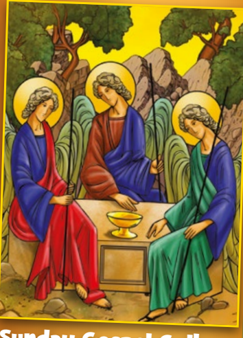
Sunday Gospel Gallery

Which word or words stood out for you in this Sunday's Gospel, and why? Spend a few relaxing moments pondering the picture together. Share any thoughts before moving on.