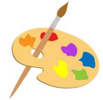
Greenling by Levi Pinfold

Not taught discretely in this topic HOWEVER pupils will create Christmas themed arts and crafts.