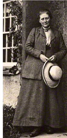
Beatrix Potter in 1913

Potter wrote about 30 books; the best known being her 24 children's tales . She died of pneumonia and heart disease on 22 December 1943 at her home in Near Sawrey at age 77, leaving almost all her property to the National Trust . She is credited with preserving much of the land that now constitutes the Lake District National Park . Potter's books continue to sell throughout the world in many languages with her stories being retold in song, film, ballet, and animation, and her life depicted in a feature film and television film.