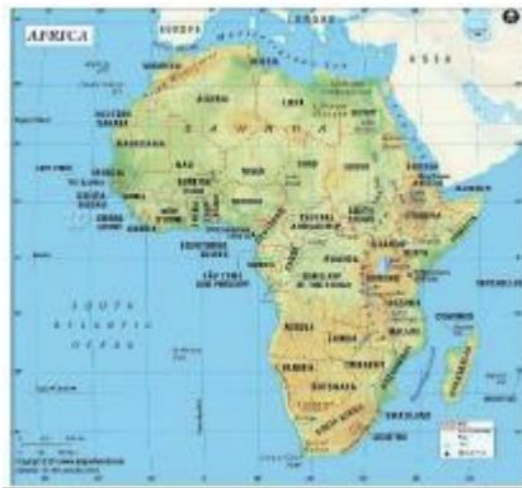
Map of Africa